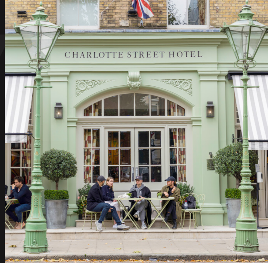
Charlotte Street Hotel

77 Charlotte Street sits in the heart of modern Fitzrovia. Charlotte Street is home to three Michelin-starred restaurants as well as a multitude of chic bars and shops. The building is extremely well connected with Goodge Street (2 mins walk), Warren Street (8 mins walk) and Tottenham Court Road (9 mins walk) where the Elizabeth Line takes you to Heathrow in 28 mins.