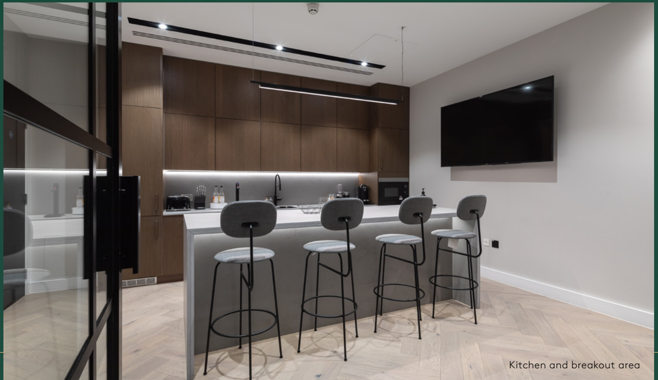
Kitchen and breakout area